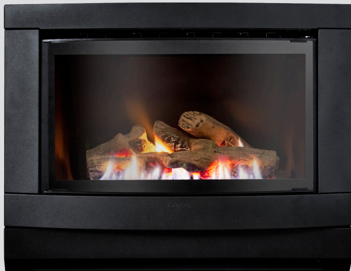
Figure 1: Cannon Armadale Inbuilt