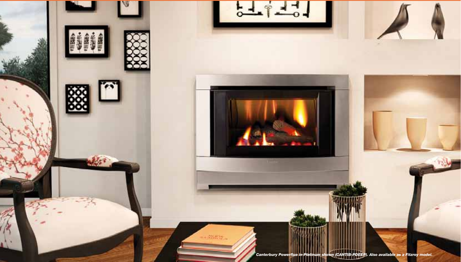
Canterbury Powerflue in Platinum shown (CANTIB-PDEEP). Also available as a Fitzroy model.